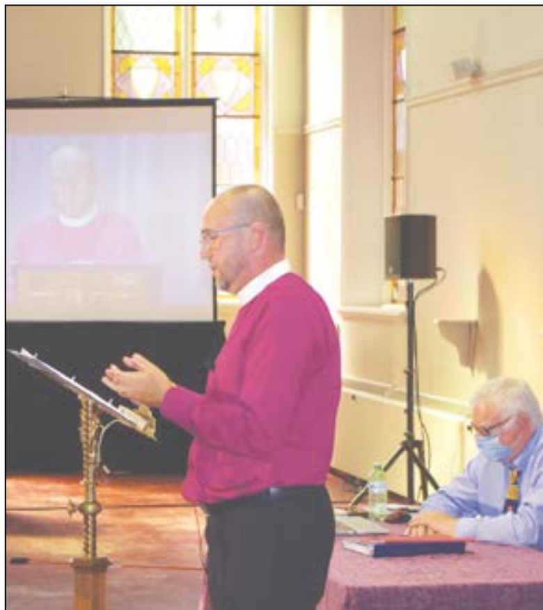
Bishop of Huron's charge at 180 th diocesan Synod, Cronyn Hall, St. Paul's Cathedral, London Ontario, September 26, 2020

Strategic Goal: To shift the centre of gravity in the Diocese of Huron from operations to renewal and new creation, better revealing the marks of mission