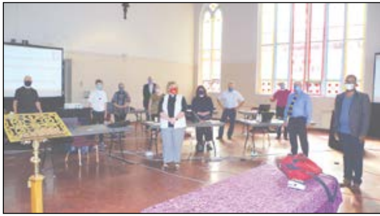
“Command Central” at St. Paul’s Cathedral: this is the team that made the first virtual Huron Synod possible

In answer to the question “where are we now?” in light of the COVID pandemic, synod then addressed issues in the wording of canons 18, 19, 43 concerning those responsible