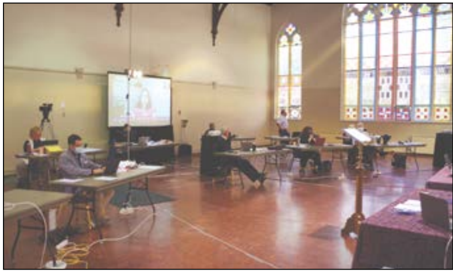
Physically distanced, virtually gathered: everyone in Cronyn Hall was focused on their specific task

Because the judge is just. So, we cherish and seek God's justice