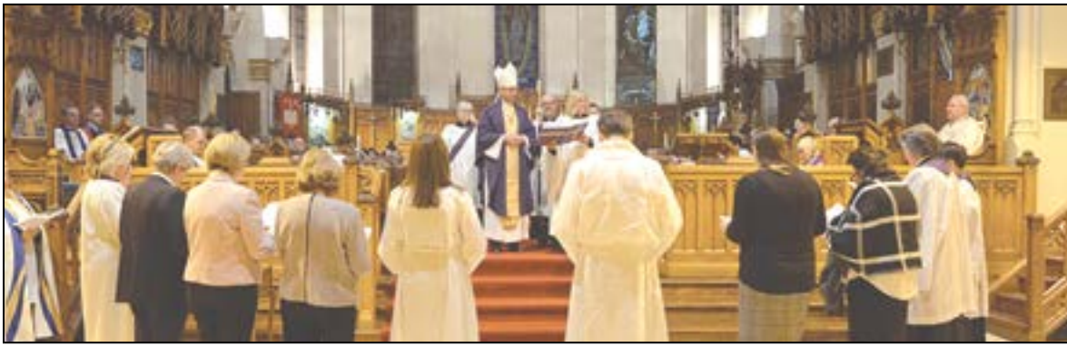
The last big gathering in Huron before the pandemic: Ordination service, January 2020